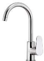
IMMAGINE - IMAGE