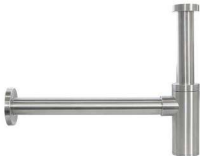
IMMAGINE - IMAGE