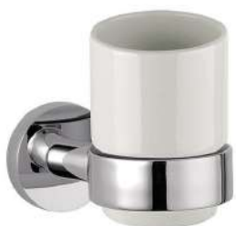
IMMAGINE - IMAGE