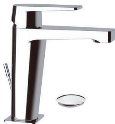
IMMAGINE - IMAGE