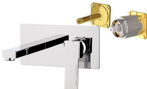
IMMAGINE - IMAGE