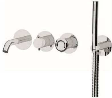
IMMAGINE - IMAGE