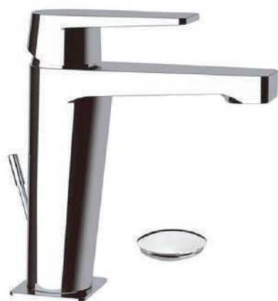
IMMAGINE - IMAGE